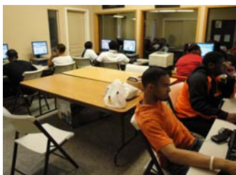
The Youth Expo participants use the computers in the Literacy Center

tion is extended to all who worked tirelessly to make 2010 Youth Expo a highly successful event. The food was absolutely magnificent, the programming was inspirational and the attendees were blessed by the power of the Holy Spirit. Kudos for a job well done!